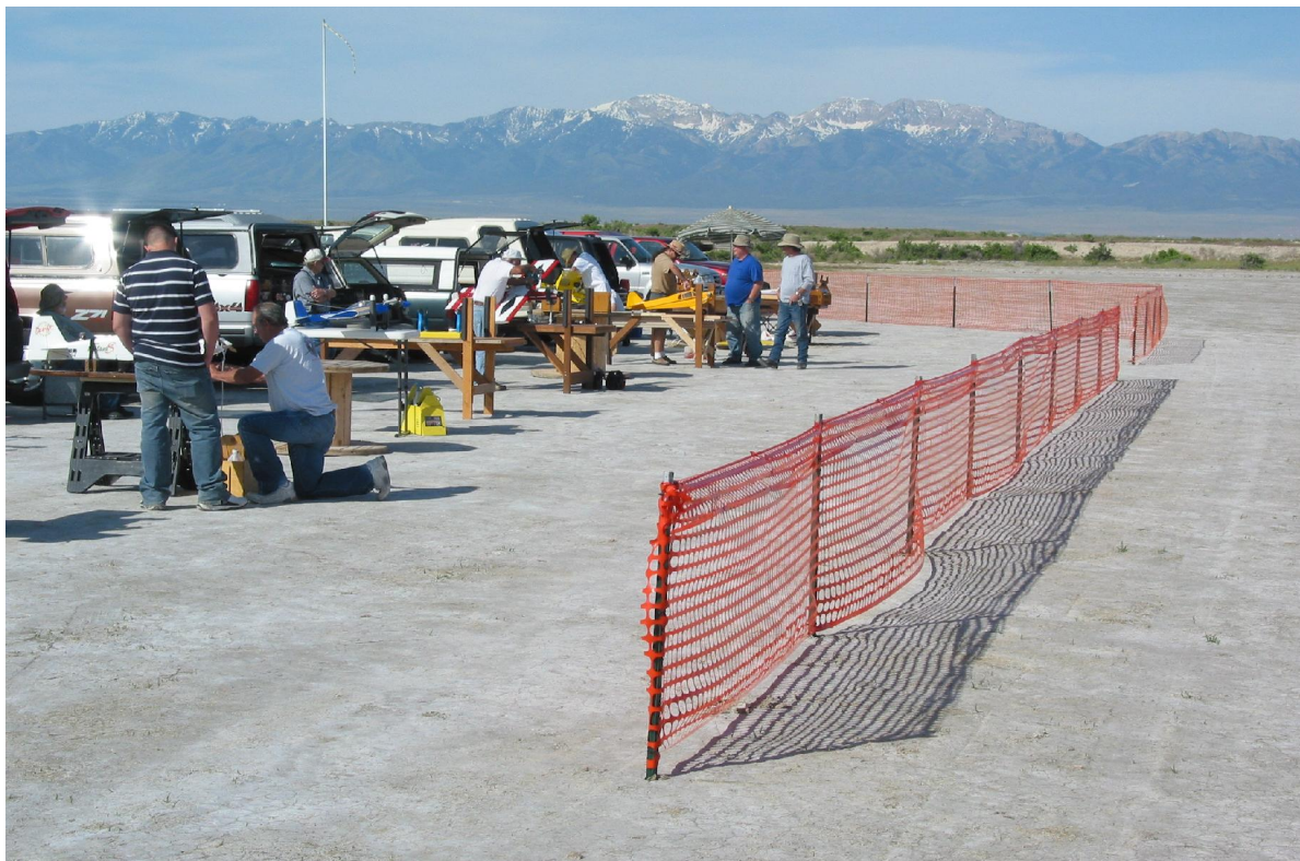
At the balloon bust – check out the new fence!