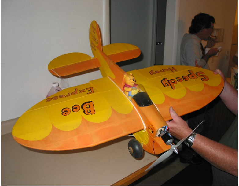
Ken's Speedy Bee.