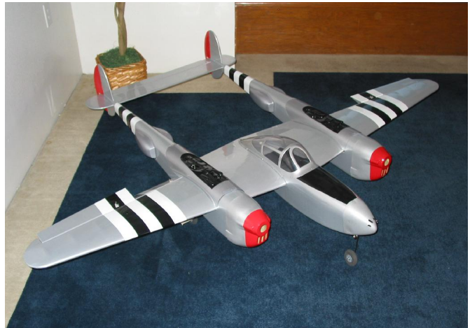
Jerry's nitromodels P-38 – under construction.