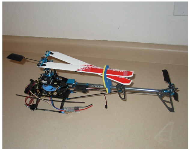
Mike's helicopter – almost ready.