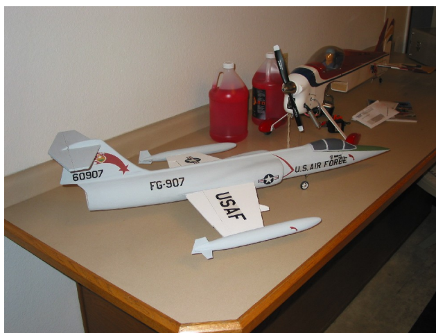
And from last October – probably one of Daves planes