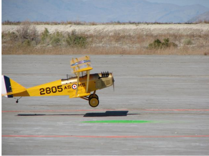
That's one way to get the egg on the target!