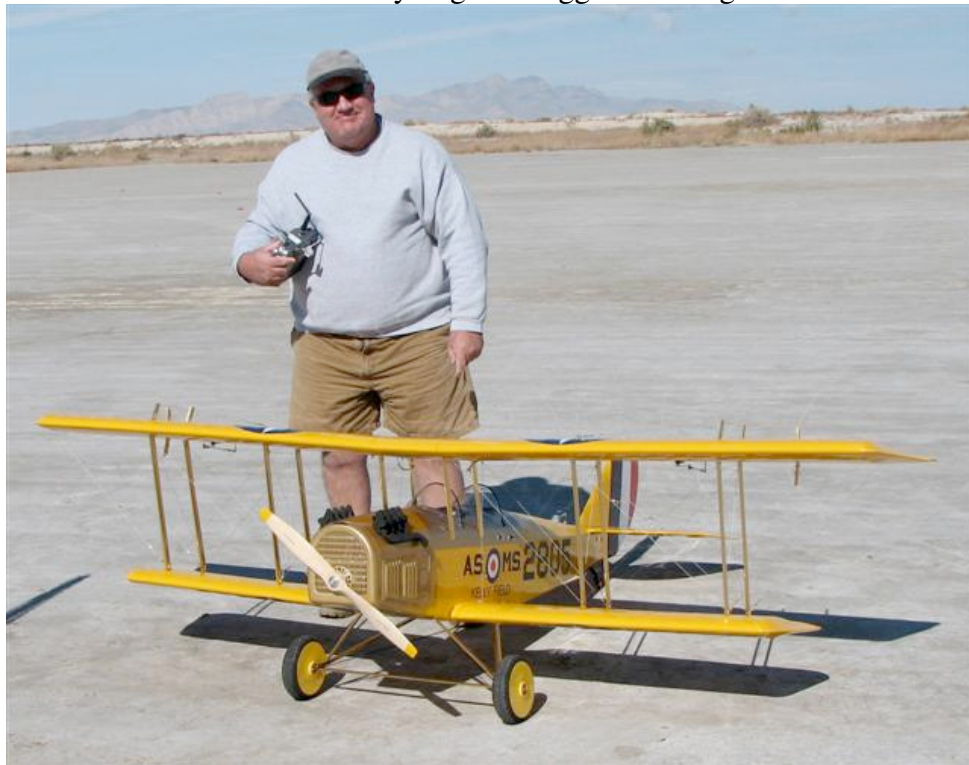
Survived the maiden! It was a beautiful flight.